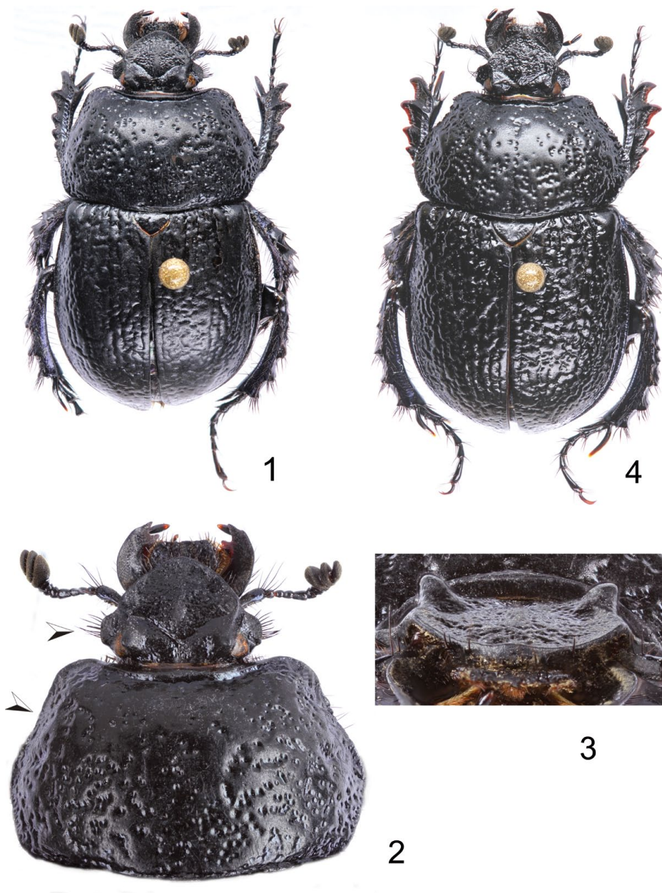
Figs 1–4. Odontotrypes (O.) hubeicus sp. nov., 1–3 – holotype (♂), 4 – allotype (♀). 1 – habitus, 2 – head and pronotum, 3 – head, 4 – habitus. 1–2, 4 – dorsal view; 3 – frontal view. Not to scale.