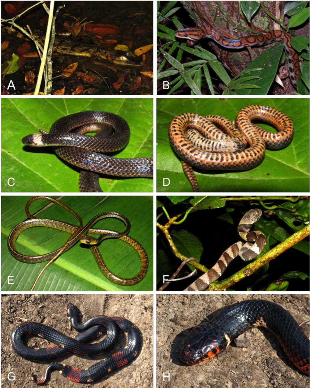
Fig. 10. Reptile species recorded in the northern part of the Regional Conservation Area Imiria or in its close vicinity. A – Caiman crocodilus . B – Epicrates cenchria . C, D – Atractus sp. E – Chironius multiventris . F – Dipsas indica . G, H – Micrurus surinamensis .