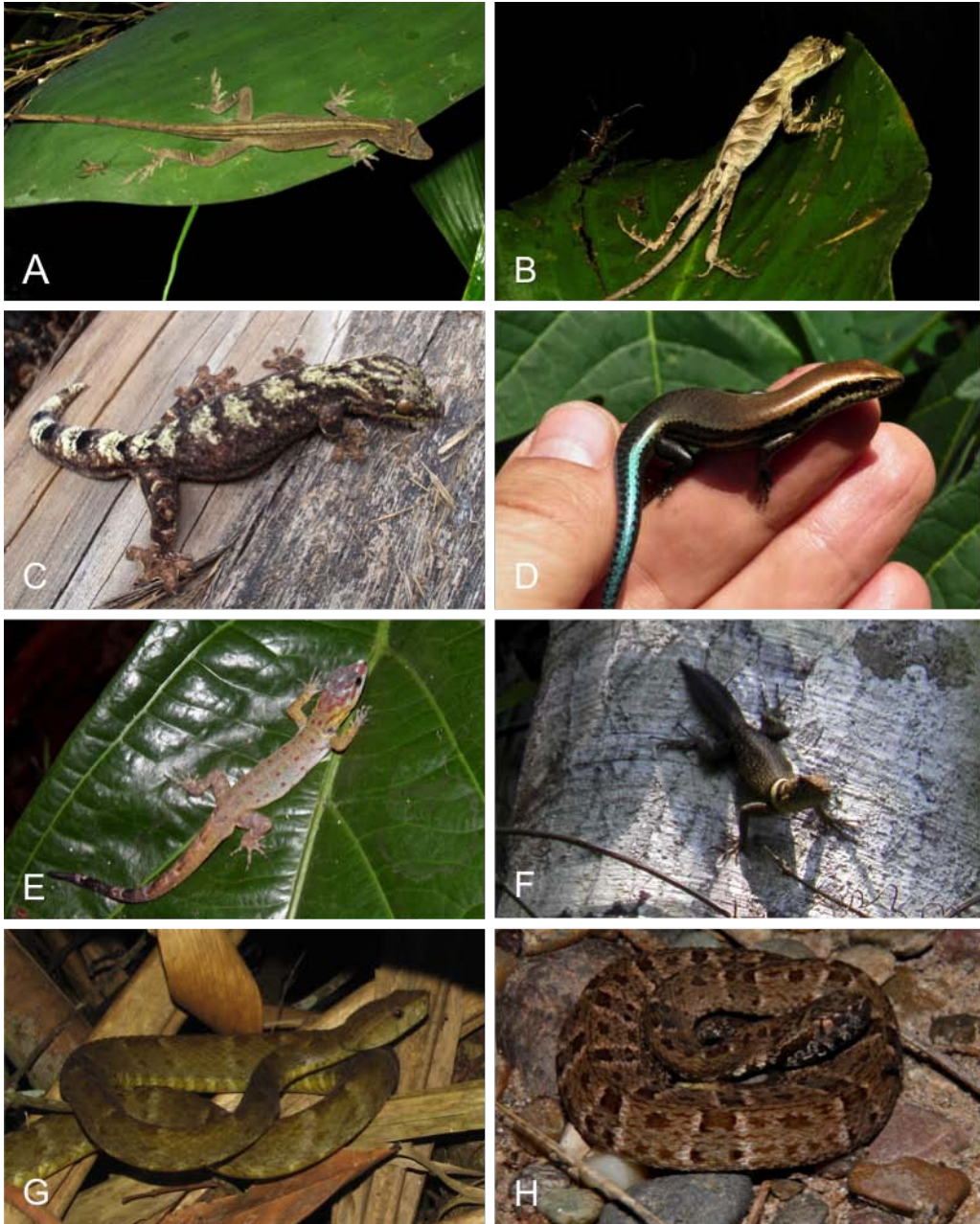
Fig. 11. Reptile species recorded in the northern part of the Regional Conservation Area Imiria or in its close vicinity. A – Anolis fuscoauratus . B – A. scyphus . C – Thecadactylus solimoensis . D – Mabuya nigropunctata . E – Gonatodes humeralis . F – Uracentron flaviceps . G, H – Bothrops atrox (G – adult individual [CP1], H – subadult individual [CP4]).