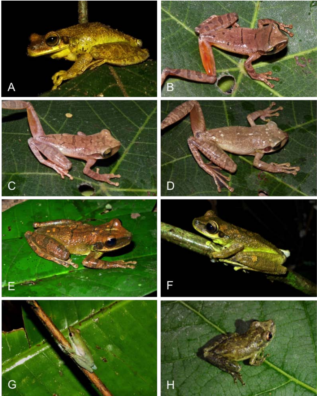
Fig. 7. Anuran species recorded in the northern part of the Regional Conservation Area Imiría or in its close vicinity. A–F – Osteocephalus yasuni (A – sexually active male, B – subadult individual [SVL 36 mm], C – subadult individual [SVL 43 mm], D – sexually inactive adult male, E, F – adult males from the area of Rio Curaray [Region Loreto]). G – Scarthyla goinorum . H – Scinax cruentommus .