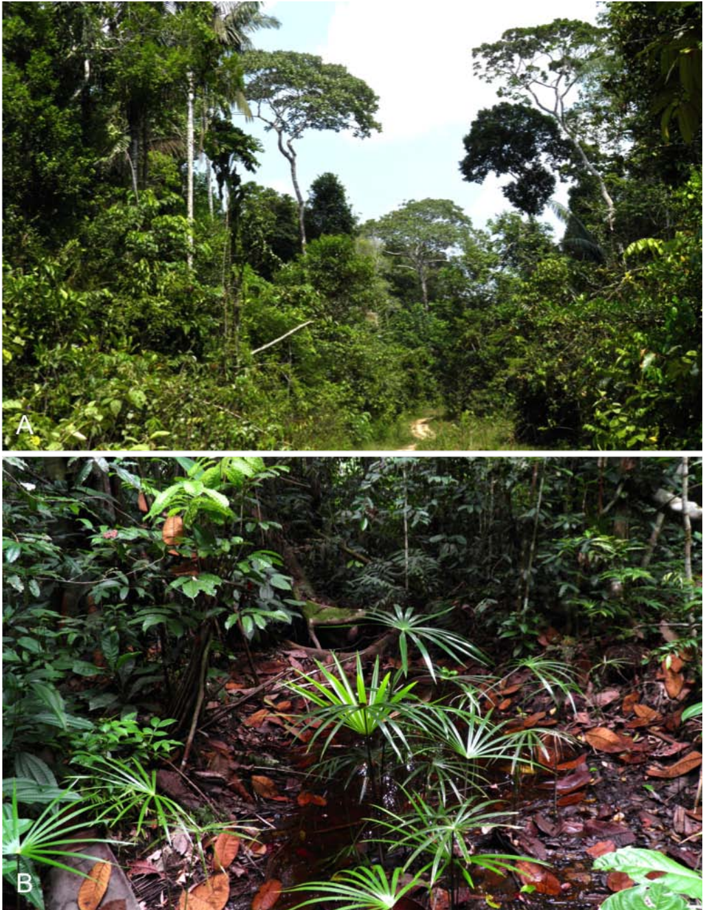
Fig. 3. Examples of typical habitats of the Regional Conservation Imiria. A – forest road in the at the collecting point CP6. B – an understory of seasonally flooded forest at CP3 with frequent occurrence of Mauritia flexuosa seedlings.