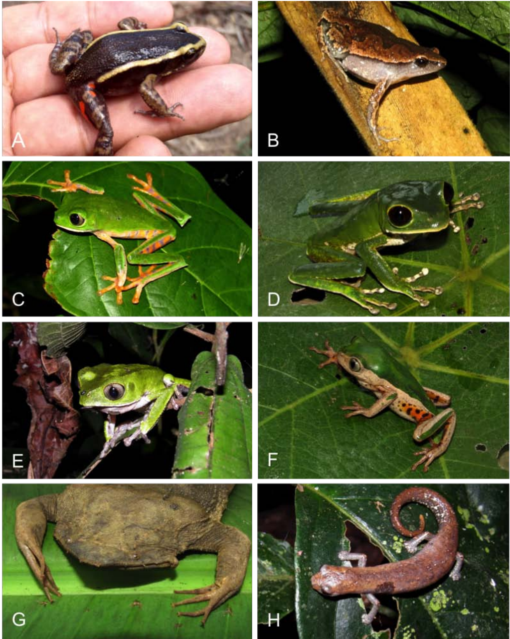
Fig. 9. Amphibian species recorded in the northern part of the Regional Conservation Area Imiriá or in its close vicinity. A – Lithodytes lineatus . B – Hamptophryne boliviana . C – Callimedusa tomopterna . D – Phyllomedusa camba . E – P. vaillantii . F – Pithecopus palliatus . G – Pipa pipa . H – Bolitoglossa cf. altamazonica .