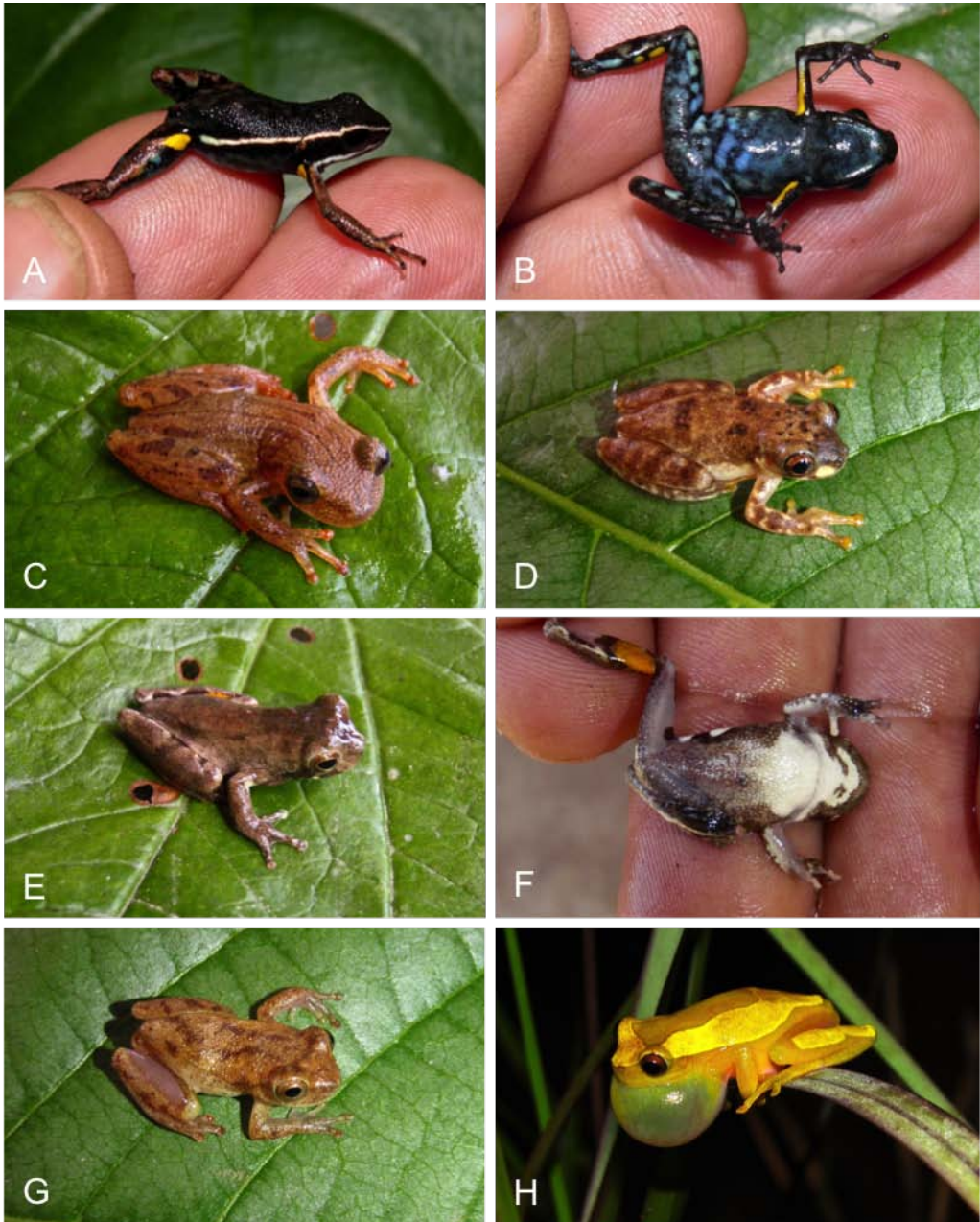
Fig. 5. Anuran species recorded in the northern part of the Regional Conservation Area Imiría or in its close vicinity. A, B – Ameerega cf. hahneli . C – Dendropsophus haraldschultzi . D – D. cf. leali . E, F – D. parviceps . G – D. cf. riveroi . H – D. triangulum .