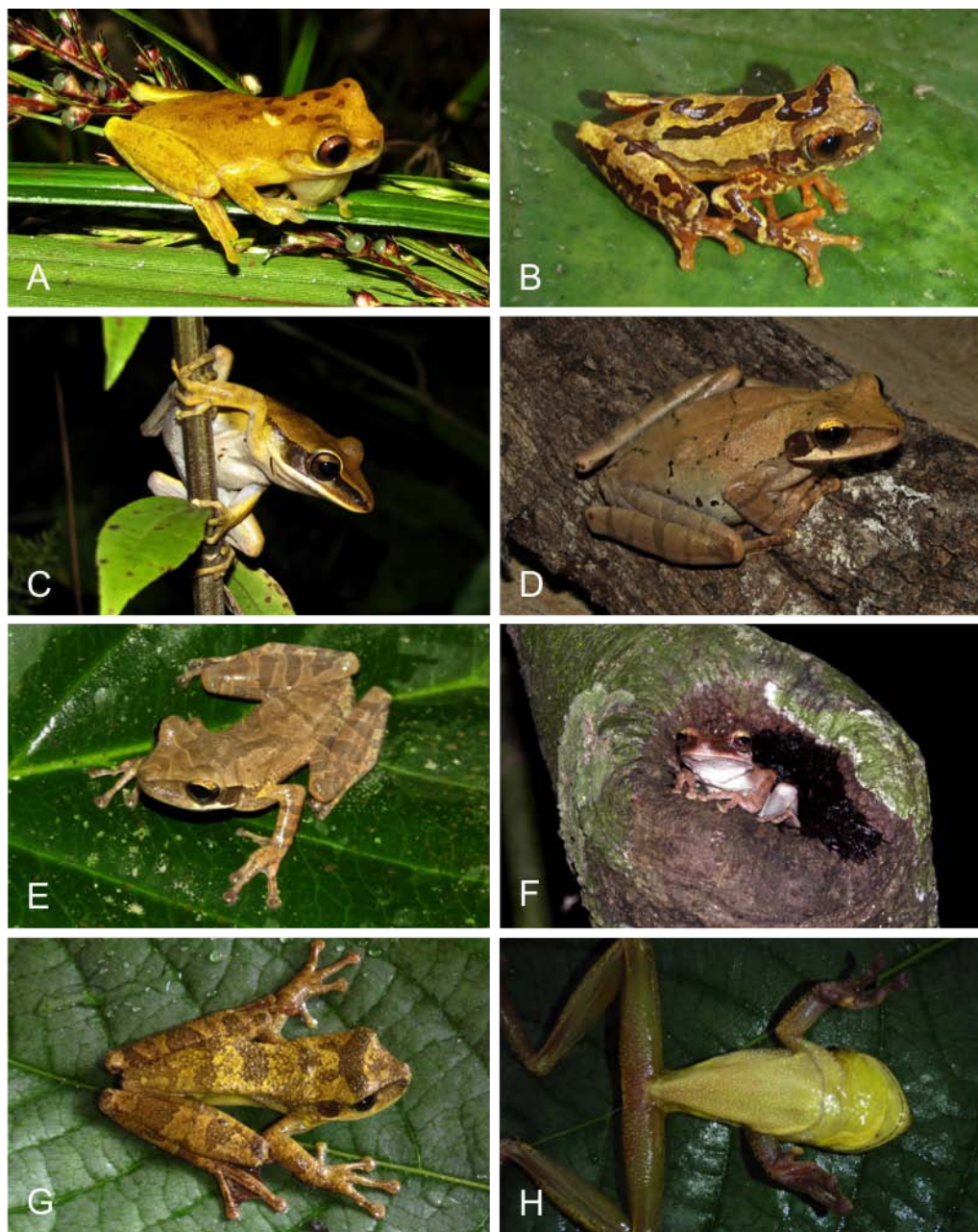
Fig. 6. Anuran species recorded in the northern part of the Regional Conservation Area Imiriá or in its close vicinity. A, B – Dendropsophus triangulum . C – Hypsiboas lanciformis . D, F – Osteocephalus planiceps (D – adult female, E – subadult individual [SVL 44 mm]). G, H – O. yasuni , sexually active male.