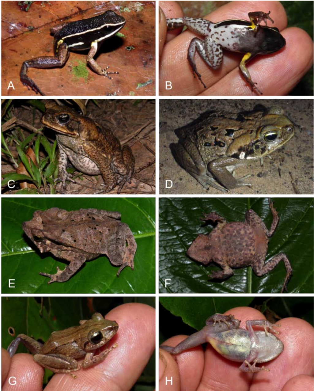
Fig. 4. Anuran species recorded in the northern part of the Regional Conservation Area Imiría or in its close vicinity. A, B – Allobates femoralis . C – Rhinella marina . D – R. poeppigii . E, F – Rhinella sp. ( R. margaritifera complex). G, H – Pristimantis delius .