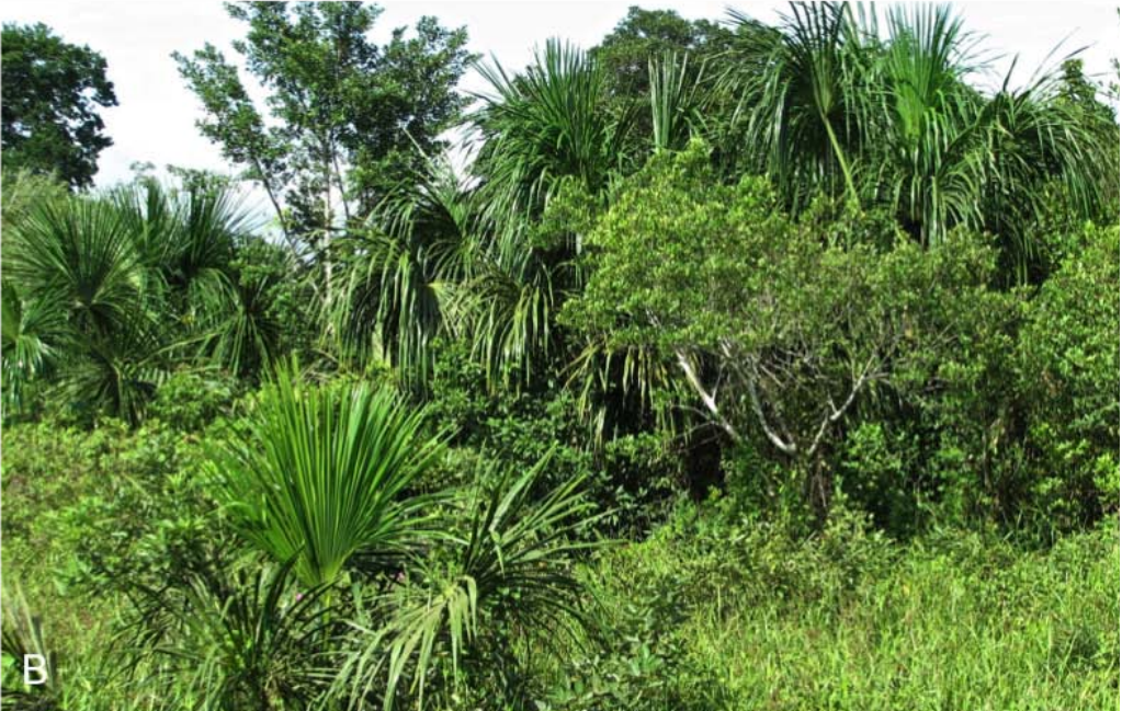
Fig. 2. Typical habitats of the anthropogenic area surrounding the community of Masisea. A – a permanent lake at collecting point CP1 covered partly by floating Pistia "carpets". B – area between CP1 and CP2 dominated by the palm, Mauritia flexuosa .