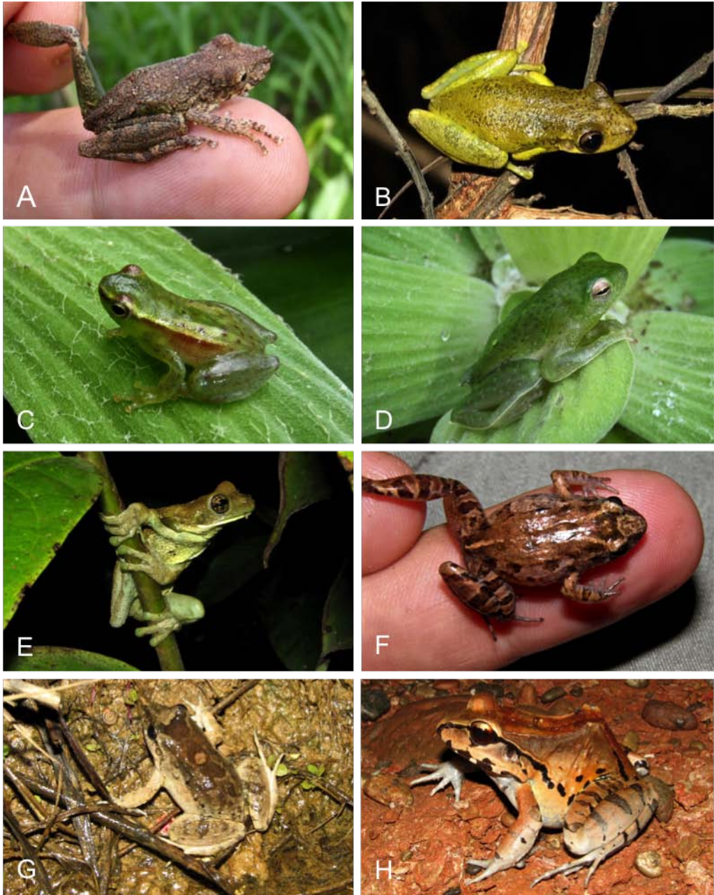
Fig. 8. Anuran species recorded in the northern part of the Regional Conservation Area Imiría or in its close vicinity. A – Scinax pedromedinae . B – S. ruber . C – Sphaenorhynchus carneus . D – S. dorisae . E – Trachycephalus typhonius . F – Adenomera sp. G – Leptodactylus leptodactyloides . H – L. pentadactylus .