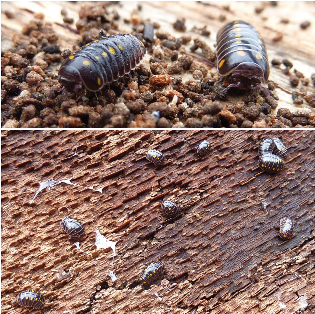
Fig. 1. The pill millipede, Glomeris pustulata Fabricius, 1781, is frequently found occurring at high densities under bark of fallen beeches: (above) pill millipedes eating faecal pellets of other phloem decomposers, (below) millipedes are abundant in their typical microhabitats.

Pill millipedes Glomeris pustulata Fabricius, 1781 (Fig. 1a) were collected in April 2011, during an excursion to Hůrka u Hranic National Nature Reserve in Moravia, the Czech Republic. Local forests were damaged by a windstorm in summer 2008 and several gaps were created. Pill millipedes are very abundant under the bark of fallen beech trees in such