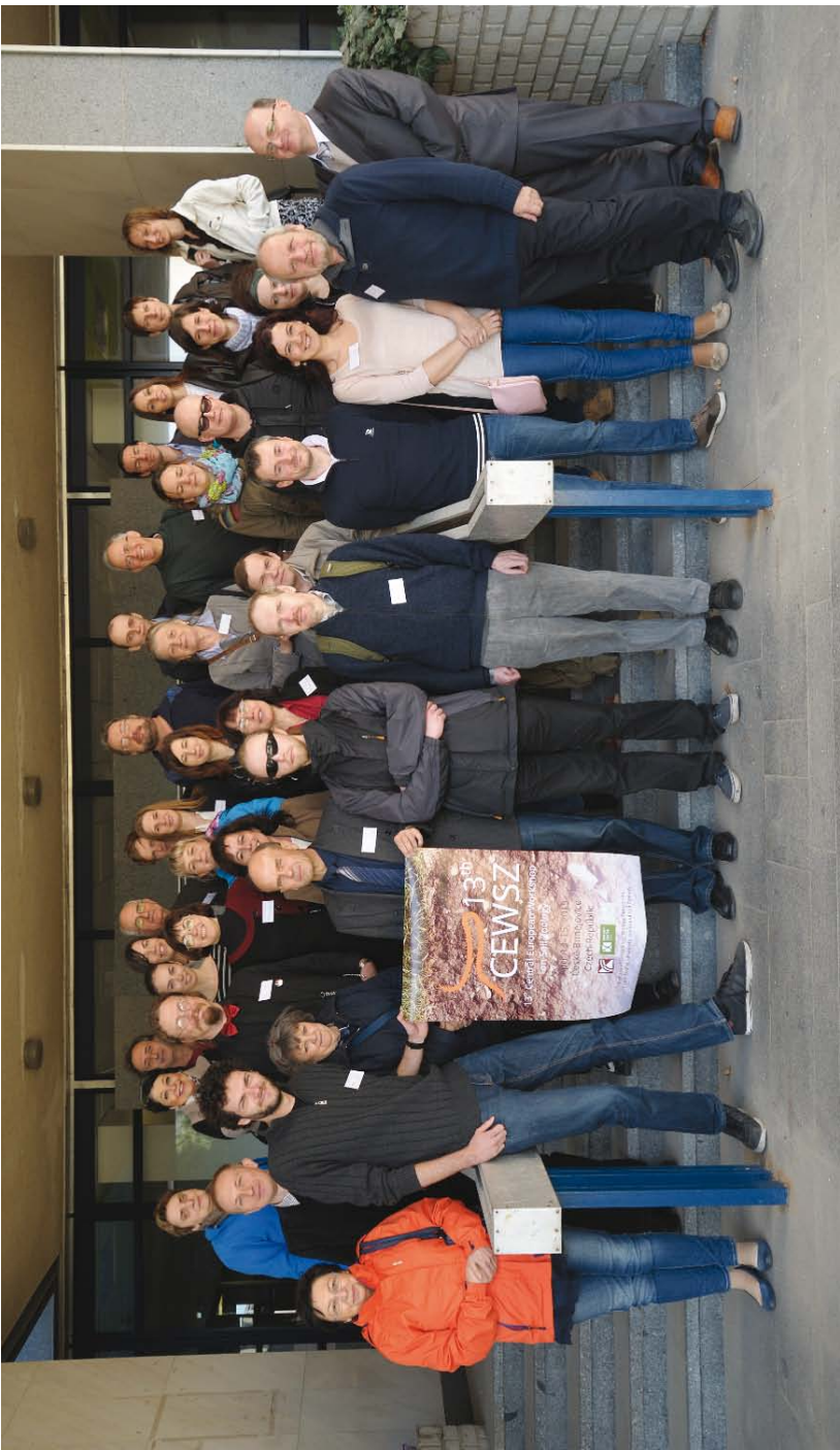
Participants of the 13th CEWSZ