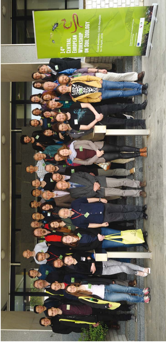
Participants of the 14th CEWSZ