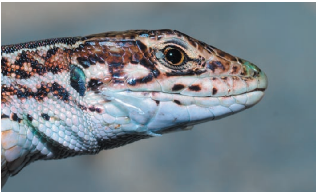
Fig. 11. Podarcis tauricus (Pallas, 1814) – adult male – lateral side of head, Váté pískey NNM.