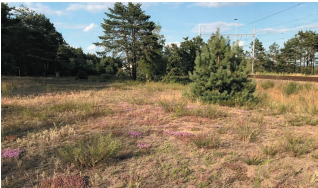
Fig. 4. Habitat of Podarcis tauricus (Pallas, 1814), Váté pískey NNM, 11 July 2019.