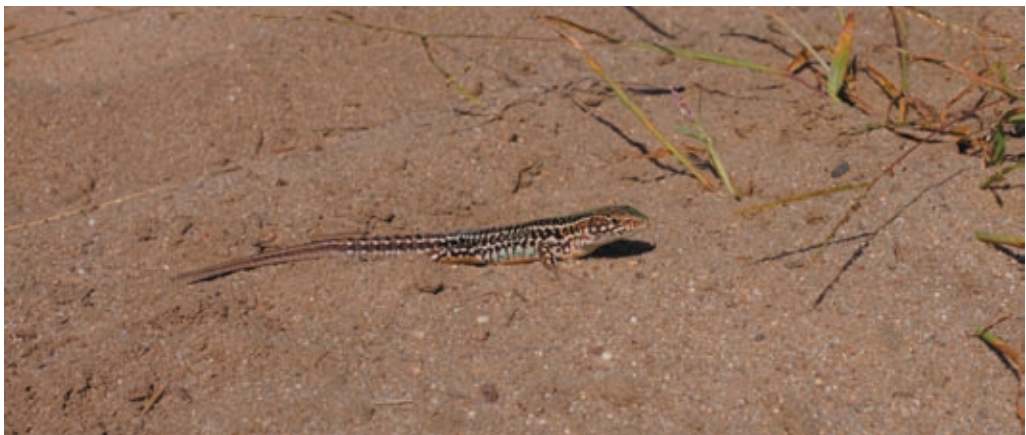
Fig. 9. Podarcis tauricus (Pallas, 1814) – adult male, Váté pískey NNM, 5 September 2019.

An important factor is the management of vegetation coverage on the site. According to our observations, P. tauricus prefers sparsely overgrown places. However, this habitat with sparse vegetation is relatively short-lived. Without active management it ceases to exist by natural succession. In the last few years the succession in the Váté pískey has been actively blocked by the pulling of turf (the last interventions were in 2017). A continuation of such management is necessary to preserve the type of vegetation and habitat preferred by P. tauricus and thus to ensure long term existence of the newly discovered population of P. tauricus . Nagy et al. (2012) reported a grazing as a positive factor to meet habitat requirements of P. tauricus .