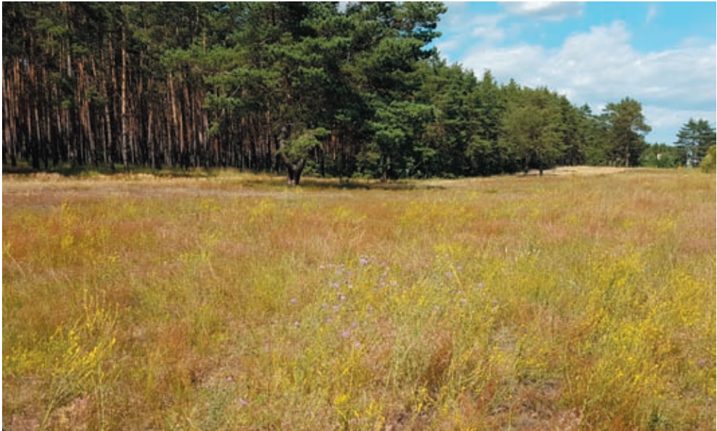
Fig. 3. Habitat of Podarcis tauricus (Pallas, 1814), Váté pískey NNM, 11 July 2019.