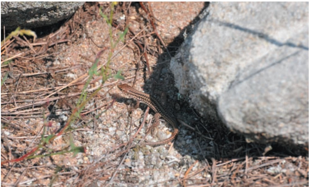
Fig. 8. Podarcis tauricus (Pallas, 1814) – hatchling, Váté pískey NNM, 10 August 2019.