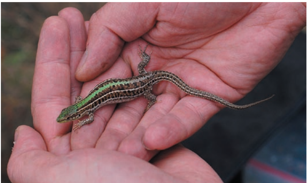
Fig. 6. Podarcis tauricus (Pallas, 1814) – gravid female, Váté pískey NNM, 11 May 2019.