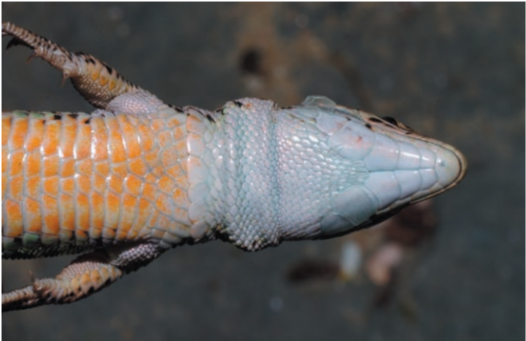
Fig. 12. Podarcis tauricus (Pallas, 1814) – adult male – ventral side of head, Váté pisky NNM.

The co-existence of P. tauricus with abundant and significantly predominant Lacerta viridis is a special issue. This much bigger and stronger lizard represents for P. tauricus potential problem both, as a predator and a competitor as well, because it is known to feed occasionally on lizards (including conspecific ones) (Kabisch 1986) and to have overlapping food spectrum (Mollov et al. 2012). Nevertheless, P. tauricus is known to live syntopically with L. viridis in Hungary (e.g. Csekés 2010, 2011) and their co-existence is facilitated through some niche segregation by the choice of different vegetation elements of the habitat (Babocsay 1997). An age-dependent habitat shifting in Lacerta viridis was reported from sandy grassland habitats in Hungary by Babocsay (1997) when only young specimens are abundant at Podarcis tauricus sites and following year disappear and are replaced by new hatchlings. Nagy et al. (2012) reported that L. viridis is much more frequent on the non-grazed fields what can be explained by the different extents of cover and heights of the vegetation, and possibly, the interspecific competition. Mollov et al. (2012)