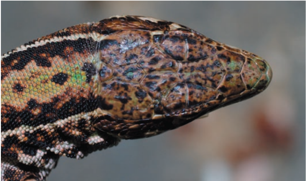
Fig. 10. Podarcis tauricus (Pallas, 1814) – adult male – dorsal side of head, Váté pískey NNM.