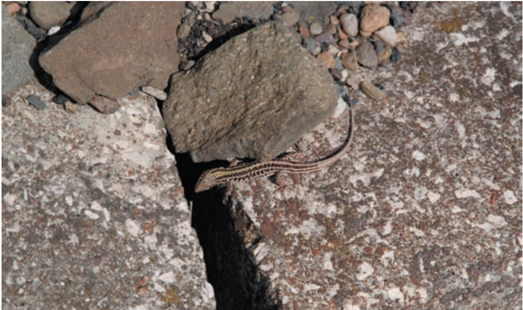
Fig. 7. Podarcis tauricus (Pallas, 1814) – adult male, Váté pískey NNM, 17 July 2019.