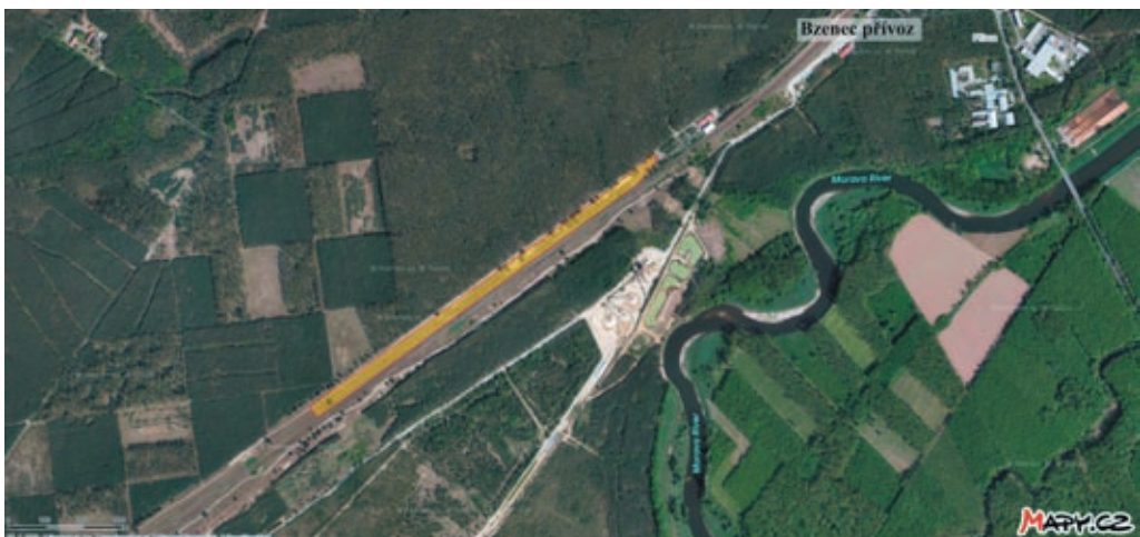
Fig. 2. Map indicating the area (yellow, in red frame) of the recorded occurrence of Podarcis tauricus (Pallas, 1814) at Váté písky NNM.

17 July 2019. 09:00–17:00. Weather clear, sunny, calm. Air temperatures 20–26 °C. KB, DF a BM recorded three P. tauricus hatchlings (i.e. this year juveniles) in a sparse steppe vegetation on edge of rail causeway with a densier vegetation (at 10:00, 10:15 and 16:30). Moreover, the adult male with a regenerated tail was seen in a sparse steppe vegetation and collected when escaped on rail causeway. All specimens were in the same site as previous ones. Dozens of subadult and adult