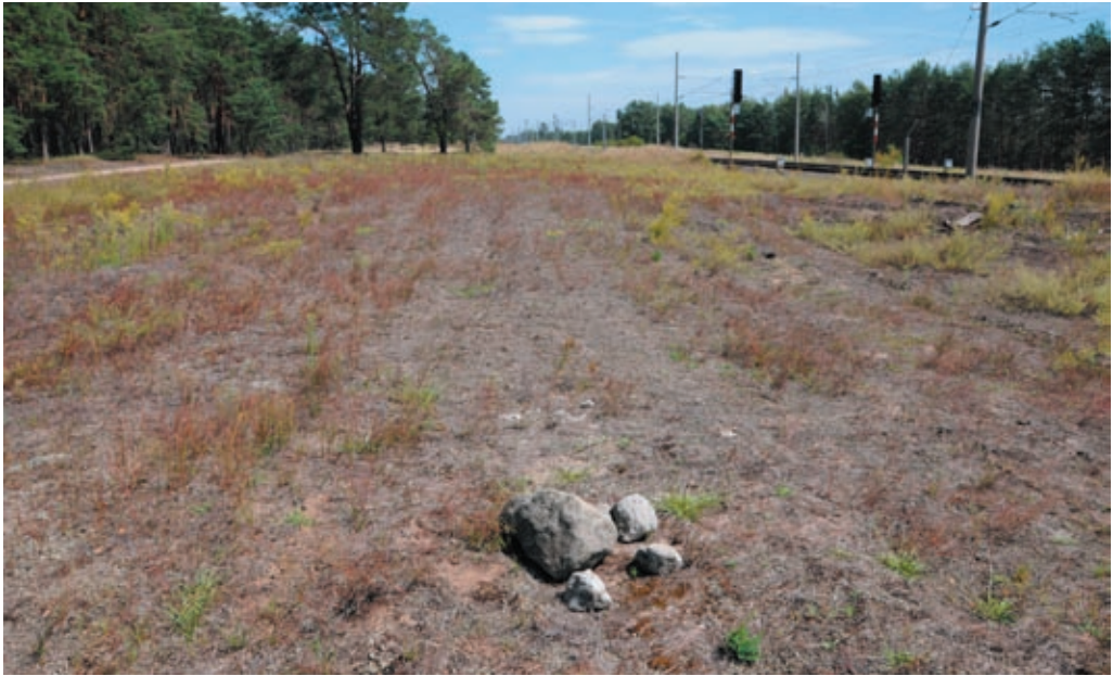
Fig. 5. Habitat of Podarcis tauricus (Pallas, 1814), Váté pískey NNM, 10 August 2019.